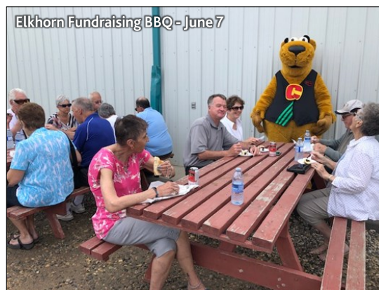
Elkhorn Fundraising BBQ - June 7