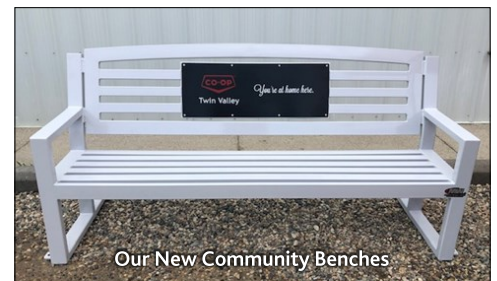
Our New Community Benches