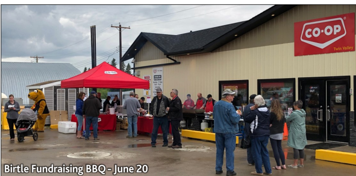
Birtle Fundraising BBQ - June 20