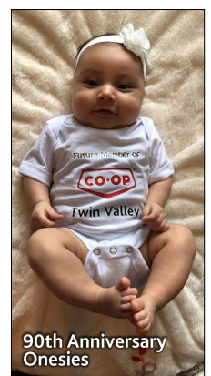
90th Anniversary Onesies