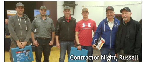
Contractor Night, Russell

Russell Home Center would like to thank all of their members for their continued support. There was a contractor night held in late April that was well attended and every indication is that the night was a overwhelming success.