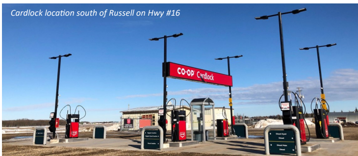
Cardlock location south of Russell on Hwy #16